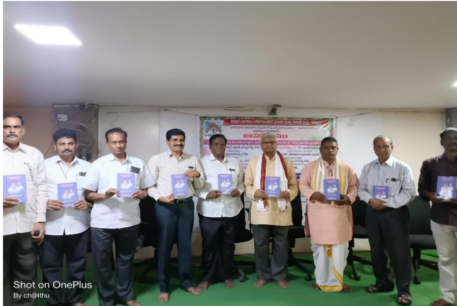
Shot on OnePlus