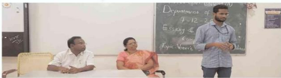
ఓటు నమోదుపై వ్యాసరచన, వక్రత్వ పోటీల్లో వివిధయస్ విద్యార్థులు