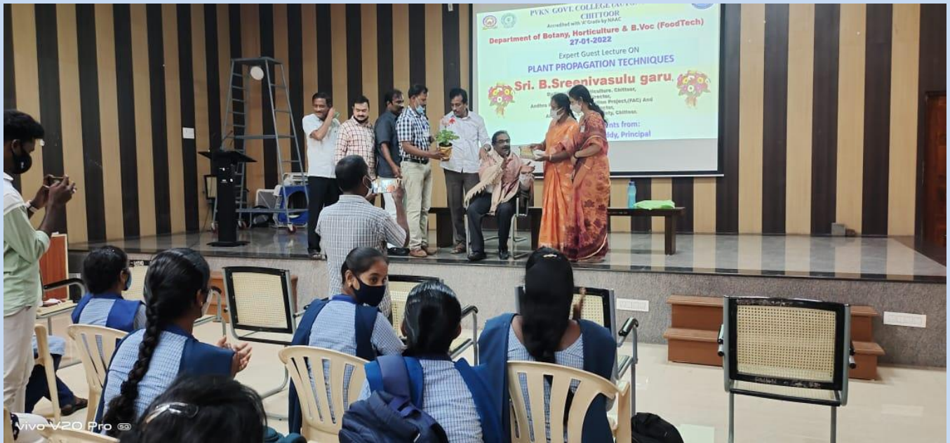
Dept. of Botany, B.Voc Food Processing Technology