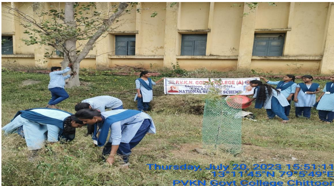
(NSS Volunteers participating in clean and green activity in teams)