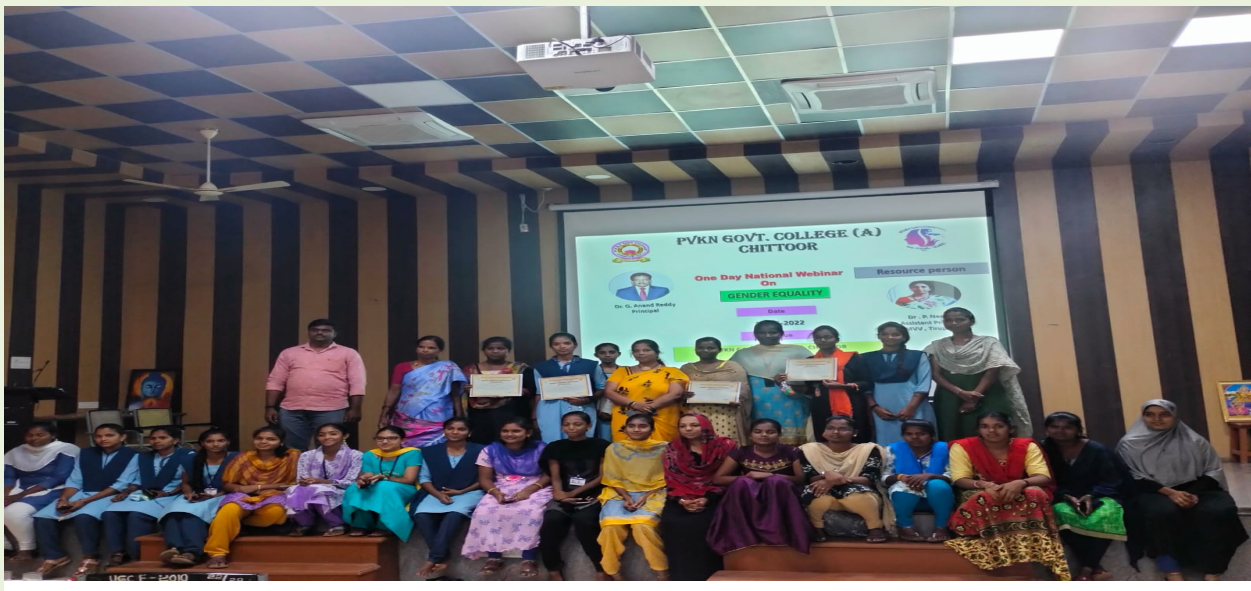
Certificates distributed for the Students Participated in Kahoot Quiz On Famous Women Personalities