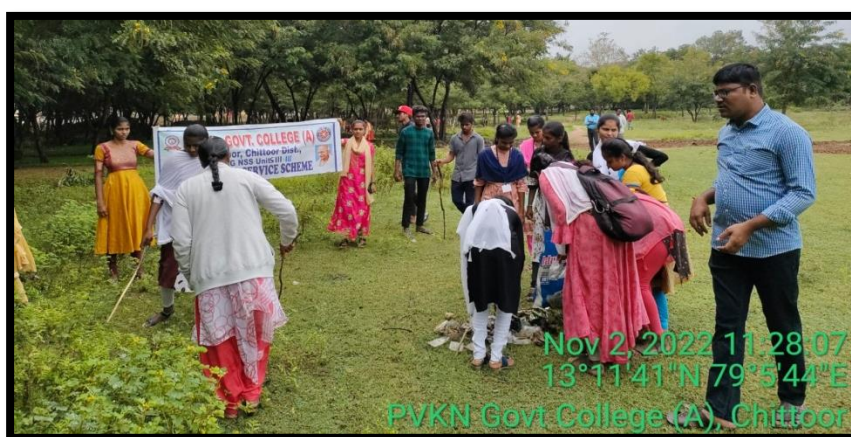
(Collection of single use plastic waste by NSS volunteers)