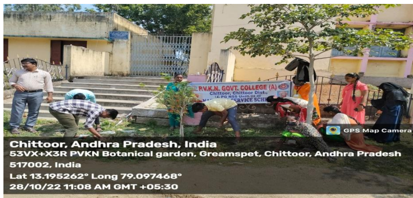
(Clean India 2.0 Campaign-Campus Cleaning by NSS volunteers)

Dr. G. Ananda Reddy, Principal, PVKN Govt. College (A), Chittoor motivated the NSS volunteers to participate in the Clean India 2.0 campaign whole heartedly. He said clean and plastic-free environment was necessary for leading healthy life. He also appealed to the NSS volunteers to spread the message of reduction in the use of plastic in their respective wards or villages. NSS volunteers of the college who were always ready to participate in the environment related activities are involved in the cleaning of different places of college premises.