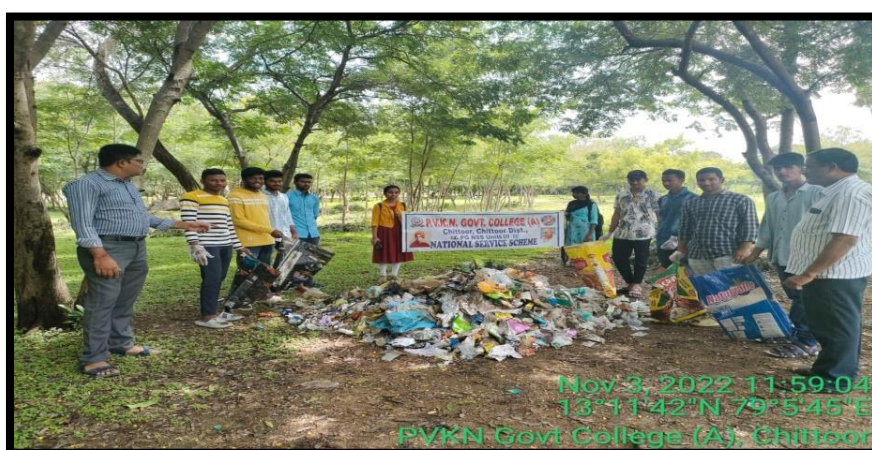
(NSS volunteers handed over the plastic waste to Municipal Corporation of Chittoor for recycling)