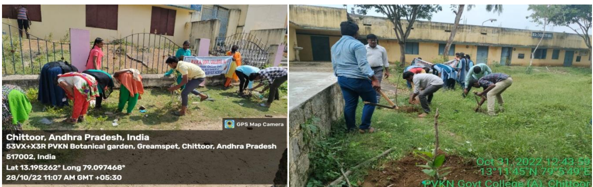
(Cleaning of campus by NSS volunteers)