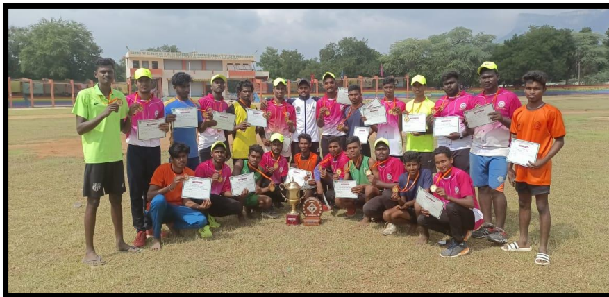
SVU TOURNAMENT - PVKN GOVT. COLLEGE (A) kho kho men team won the gold medal