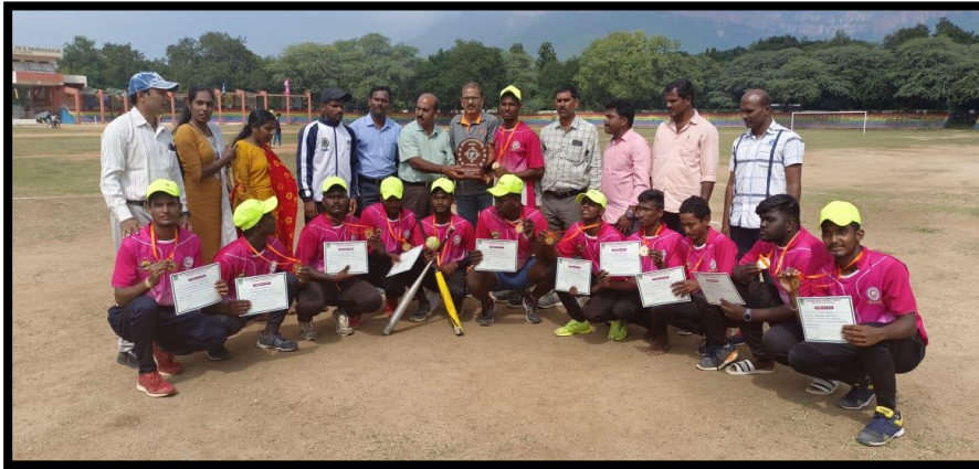
SVU TOURNAMENT - PVKN GOVT. COLLEGE (A) Soft ball men team won the gold medal