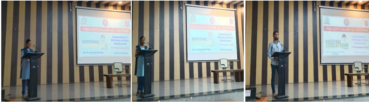
(NSS volunteers gave speech on the contributions of MaulanaAbulKalam Azad to the field of education )